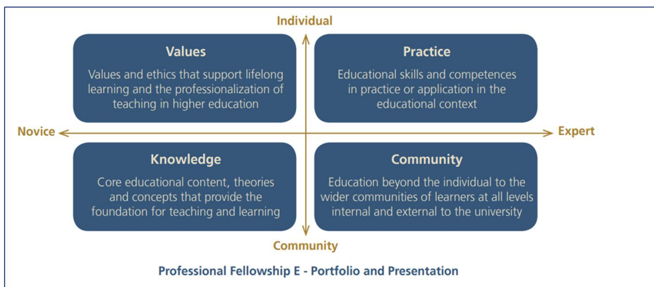
Figure 1. PFUTL Program Framework.

The PFUTL is founded in an academic development framework grounded in cultural and professional values, teaching and learning knowledge, competences and skills in practice all within the wider community and supporting the Scholarship of Teaching and Learning (SoTL). The academic-year long program is based on evidence from each module within the framework (as shown in Figure 1 below) culminating in an e-portfolio and presentation at the end of the program.