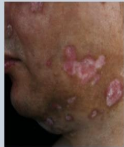
Discoid face rash