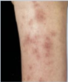
Maculopapular rash Caused by sun exposure