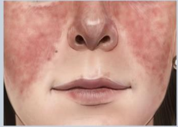
Face rash (Butterfly rash)